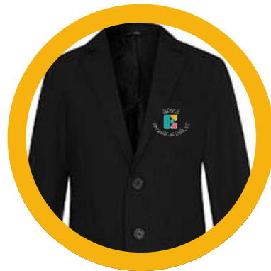
School blazer or jumper