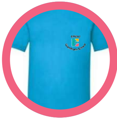
Azure logo T-shirt