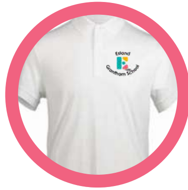
School polo shirt or buttoned shirt